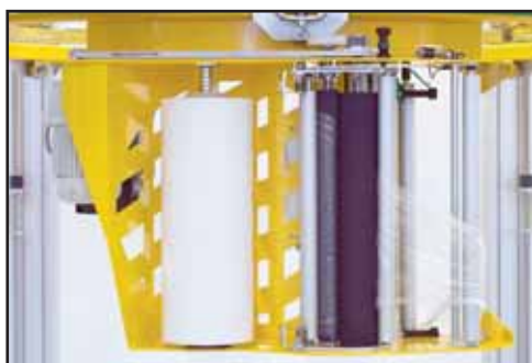
Power Pre Stretch carriage is equipped with one set of PPS gears (150 %, 220 % or 260 %).

Control voltage: 24 VDC Compressed air: 0.6 Mpa, max 9 l/cycle Noise level: < 76 dB (A)